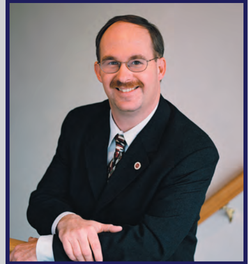
The Sales Development Pro